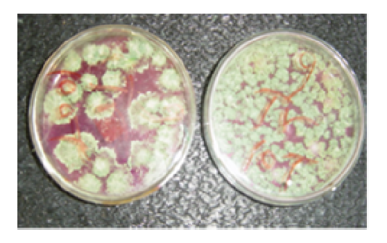
Figure 3. Colonies of T. harzianum on plate of specific medium isolated from the rhizosphere of squash plants.

Data presented in Table 5 indicated that total microbial flora count in the rhizosphere of squash plants cultivated in the uninfested soil and soil infested with F. solani and R. solani of different treatments decreased as the plant grows. The total microbial flora in soil artificially infested with the two pathogenic fungi (positive control) is generally higher than that of the uninfested soil (negative control) during most stages of plant growth. Benlate fungicide as seed dressing also stimulates the total microflora, increasing their numbers in the rhizosphere. Generally, application of T. harzianum as soil or seed treatments to soil infested with F. solani and R. solani increased the total microbial flora count during the first 30 days, while after that date the opposite trend was observed. Increase in fungal population be attributed to root exudates and sloughs which supplied the fungi with nutrients to grow and proliferate. Similar results were also obtained in Egypt by Ibrahim et al. (1996) on tomato and Sahab et al. (2001) on sesame. Benlate treatment greatly reduced the number of fungi in the rhizosphere of soil infested with F. solani and R. solani as the plant grew.