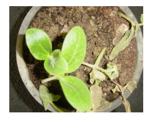
b- heavily infected soil with R. solani