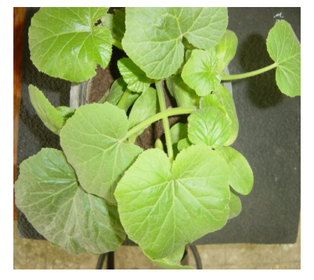
Figure 1. Plants raised from the a- control treatment