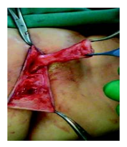
Fig. 1(c). The flap was created, the cyst and clitoral shaft dissected.

Fig. 1(b). Marking of the planned curved incision at the cranial end of the cyst to create a caudally based flap from the expanded skin over the clitoral cyst to wrap the neoglans clitoris and to line the clitoral hood.