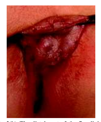
Fig. 2(h). The distal part of the flap lining, the inner aspect of the clitoral hood; maintained anatomical relationship where the folds of both labia minora diverting caudally from the clitoris. The clitoral hood projecting over the labial folds and the clitoris.