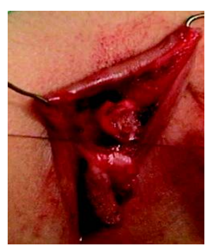
Fig. 2(d). Clitoral cyst excised leaving clean Fig. 2(e). Projecting the released clitoral clitoral stump. Release of the shaft. suspensory ligament.