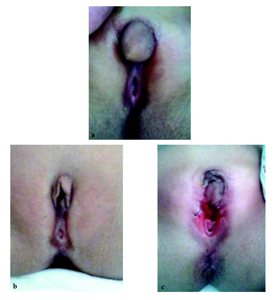
Fig. 5. Patient had the genital reconstruction in two operations due to the labial adhesions which was not possible to release it after the first operation to avoid compromising the blood supply to the base of the clitoral flap. (a). Before the first operation showing the labial adhesions at the base of the clitoral skin flap. (b). After the genital reconstruction with the non-released labial adhesions. (c). After the release of the labial adhesions in the second operation.

Our experience in reconstruction of the circumcised female without clitoral cyst, both pediatric and adult patients, none of them were included in this study