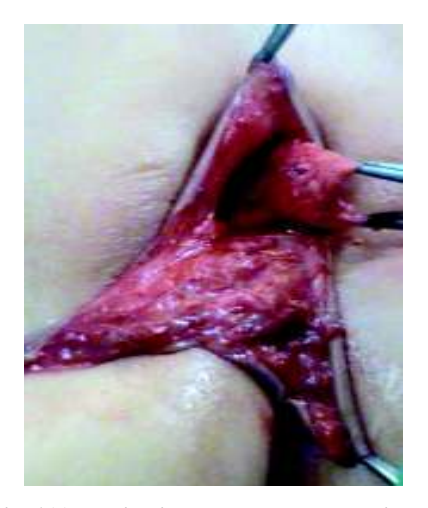
Fig. 1(d). Clitoral cyst was excised leaving Fig. 1(e). Projecting the released clitoral shaft.