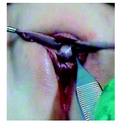
Fig. 1(f). Beginning of the clitoral wrapping Fig. 1(g). Complete wrapping of neoglans clitoris.