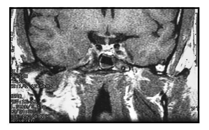
Figure 2 - Coronal T1 weighted magnetic resonance image showing a normal looking infundibulum postoperatively.

in most macroadenomas the infundibulum is thick and cannot be differentiated from the adenoma. In our case, the size of the adenoma was slightly bigger than 10mm, which allows differentiating it from the infundibulum. We think that the buckling sign can be a helpful adjunctive sign of pituitary masses. The return of the infundibulum to its normal shape makes the possibility of neoplastic involvement less likely. We conclude that buckling of the pituitary infundibulum can be a helpful adjunctive sign in the diagnosis of pituitary masses.