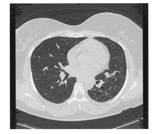
Figure 1. Bronchiectatic changes of superior segment of left lower lobe.

Copyright © 2004 by The American Association for Thoracic Surgery doi:10.1016/j.jtcvs.2004.01.011